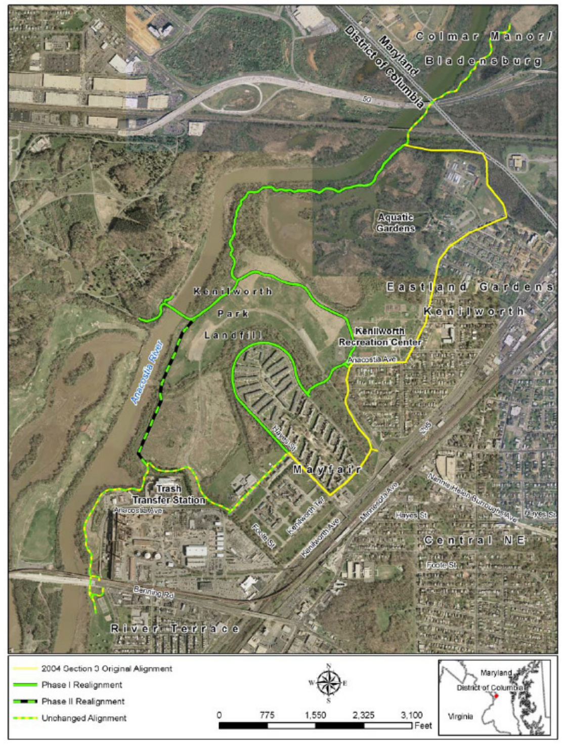
Figure 2: Proposed Alignments